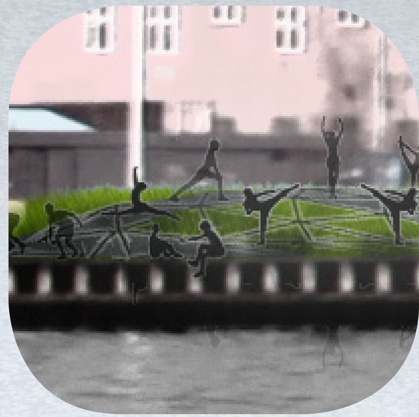
AREA of DANCE / FITNESS / GYM