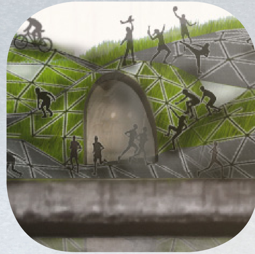
BICYCLE PATH and PATH PEDESTRIAN