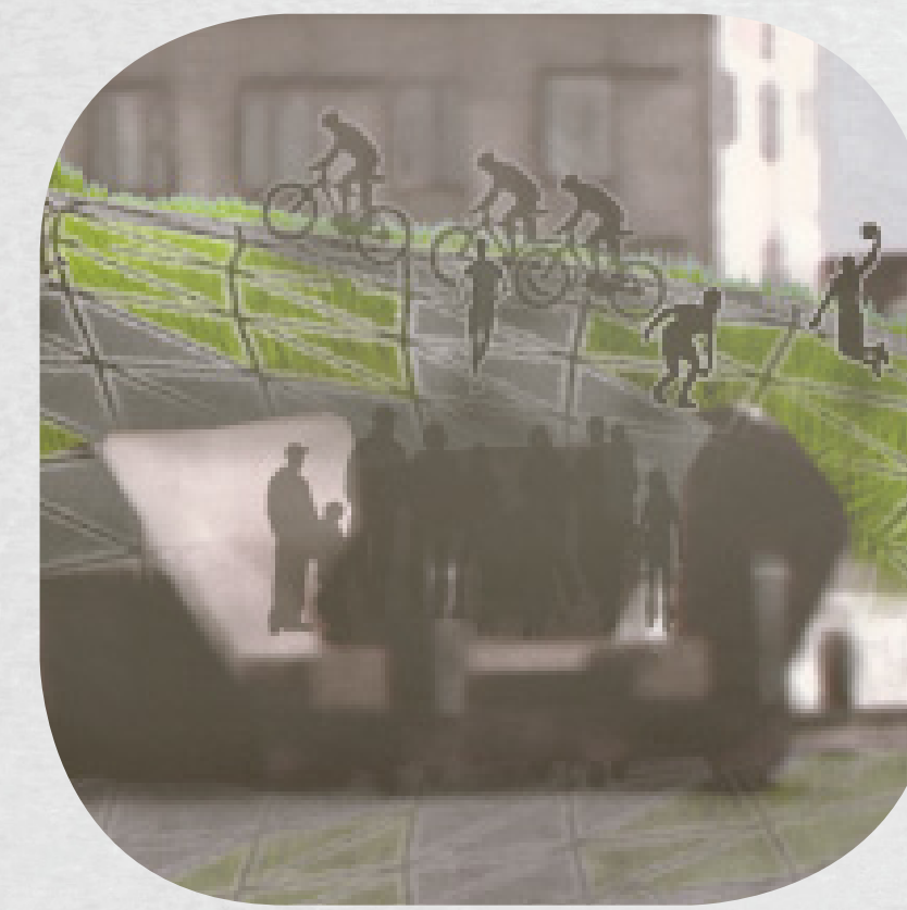
ACCESS To the SITE