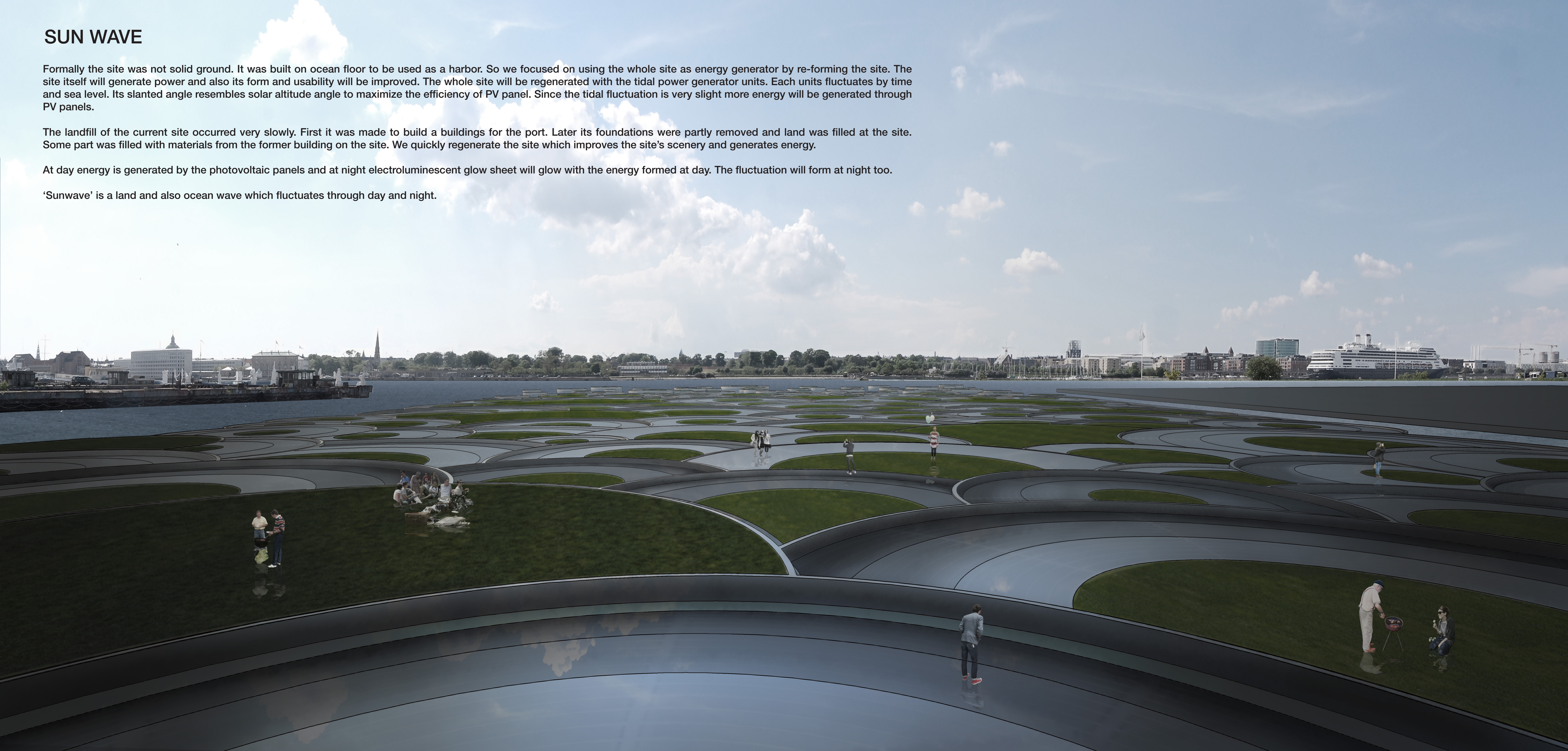
Shape of Photovoltaic panel by time

‘Sunwave’ is a land and also ocean wave which fluctuates through day and night.