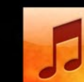
CONCERT HALL IN REFSHALEØEN, COMMERCIAL ZONE AND EVENTS.