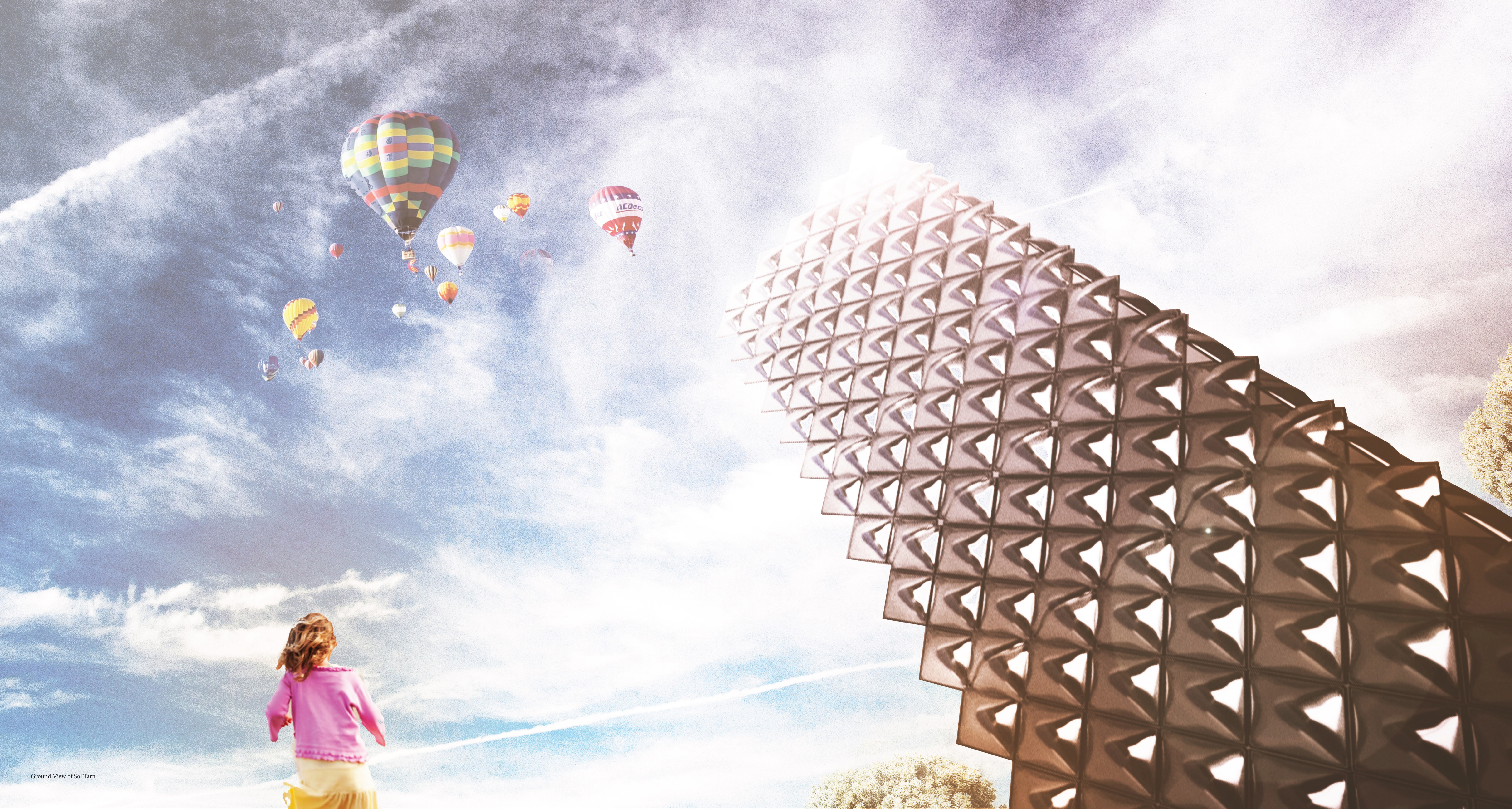
Ground View of Sol Tarn