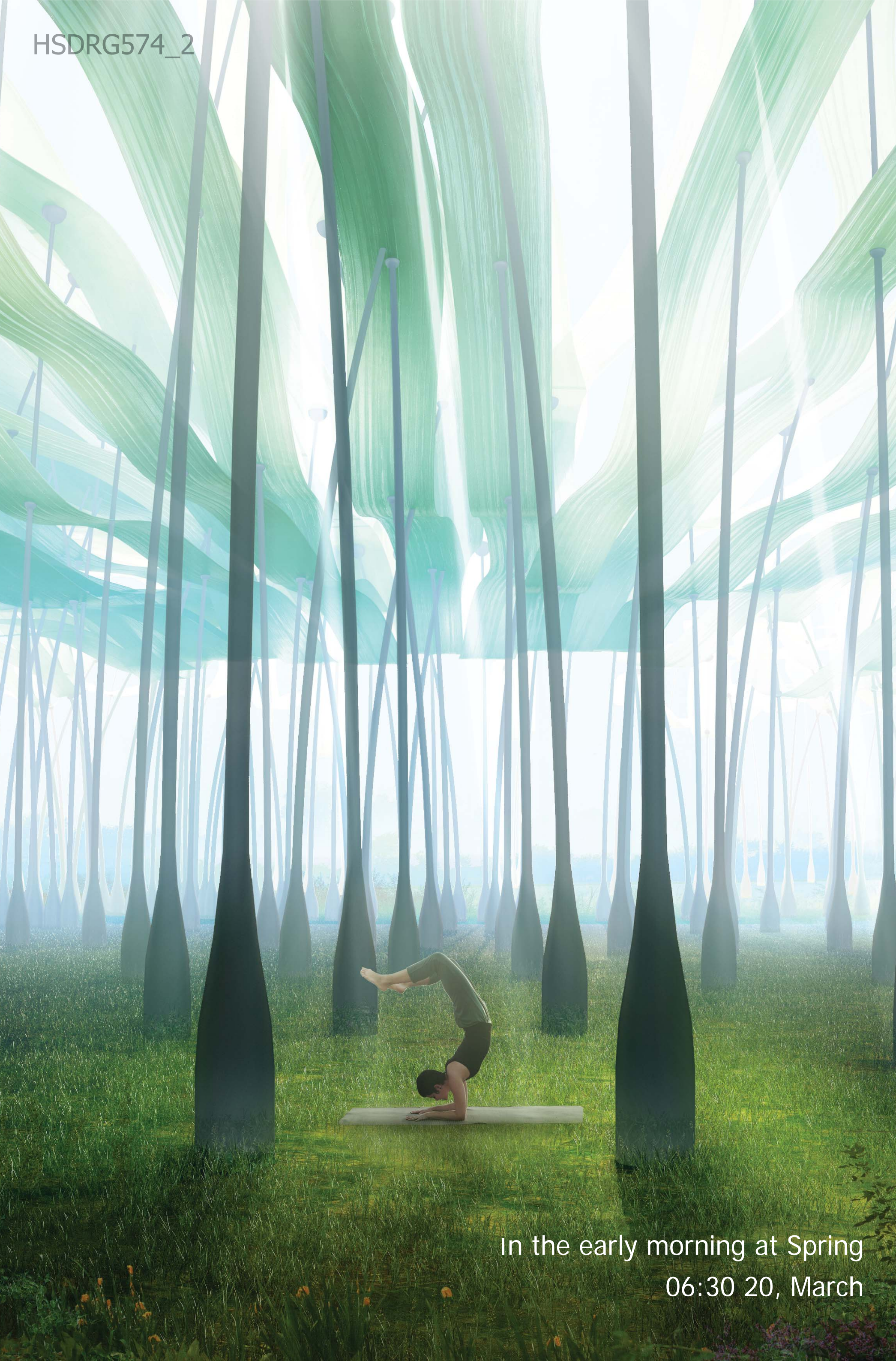
In the early morning at Spring 06:30 20, March