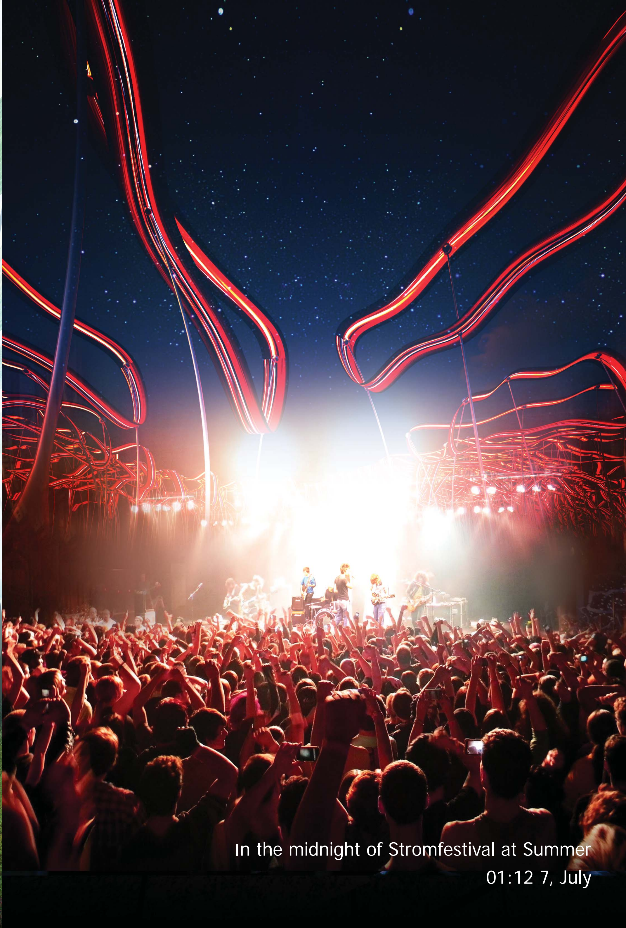
In the midnight of Stromfestival at Summer 01:12 7, July